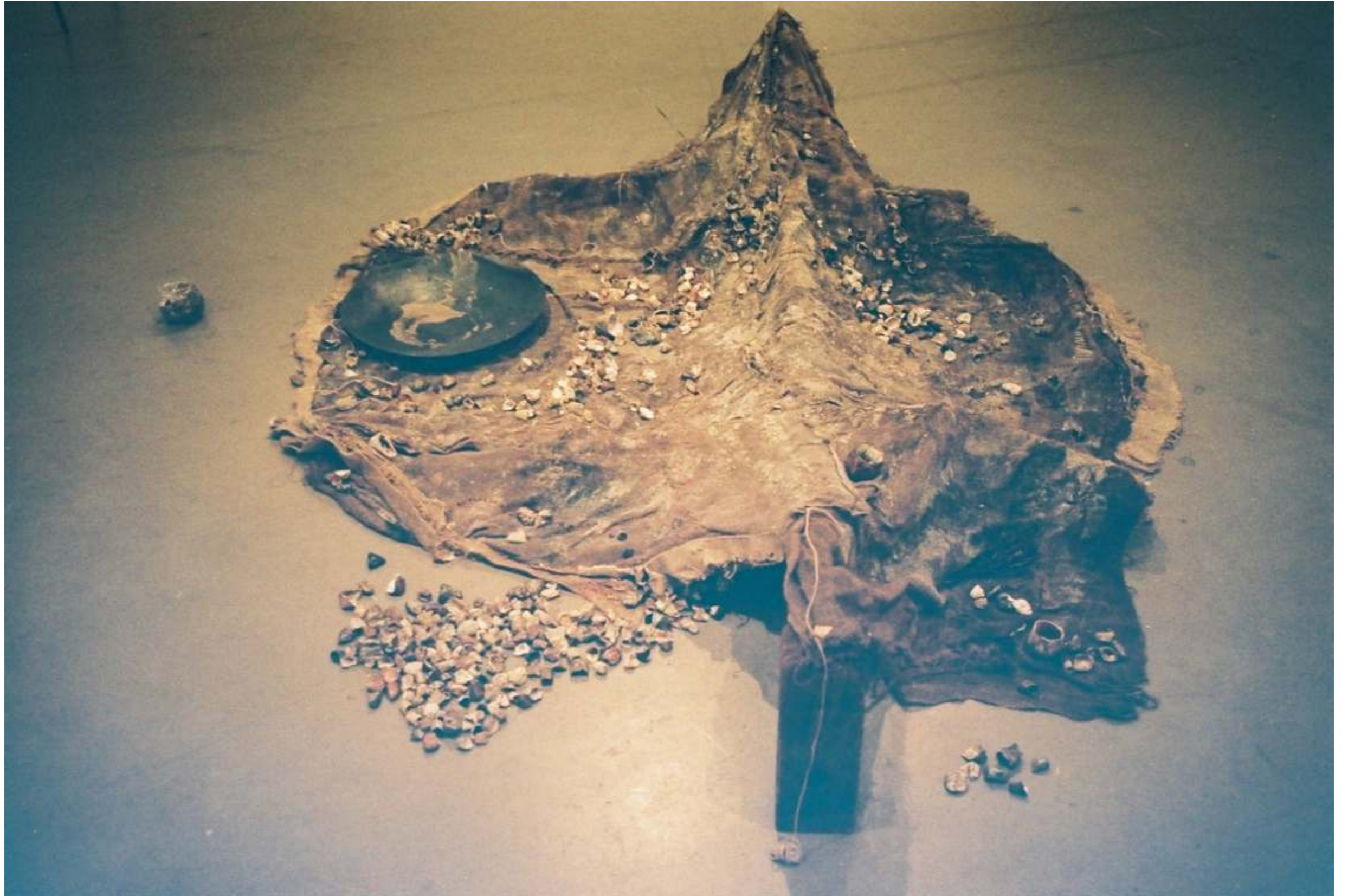
Mola Mola, Sea Room, back to where we have not quite been, Arnolfini 2015 materials: hessian, pigment, wax, newspaper, eggshell, threads and metal bowl