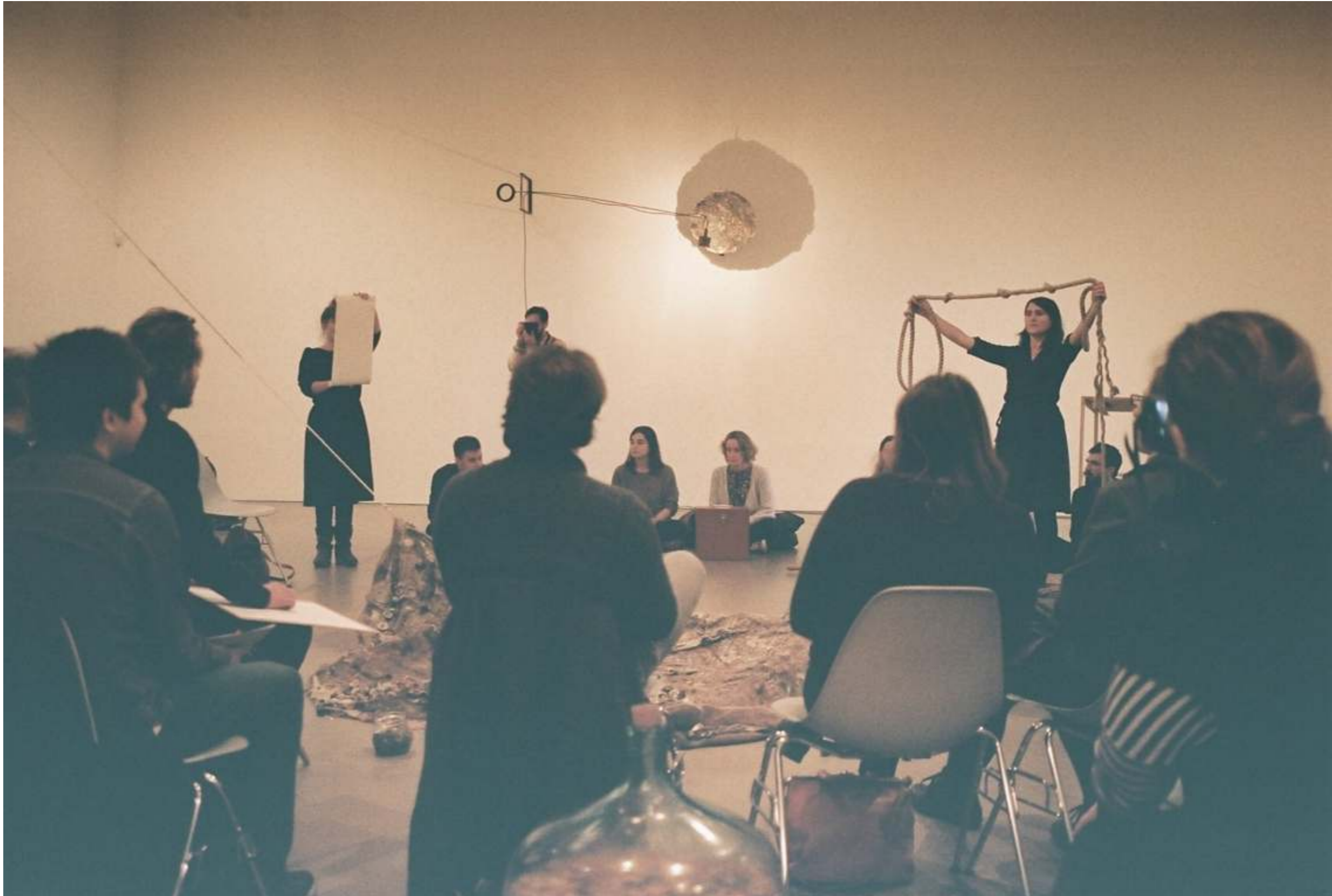
back to where we have not quite been conference, Arnolfini 2015