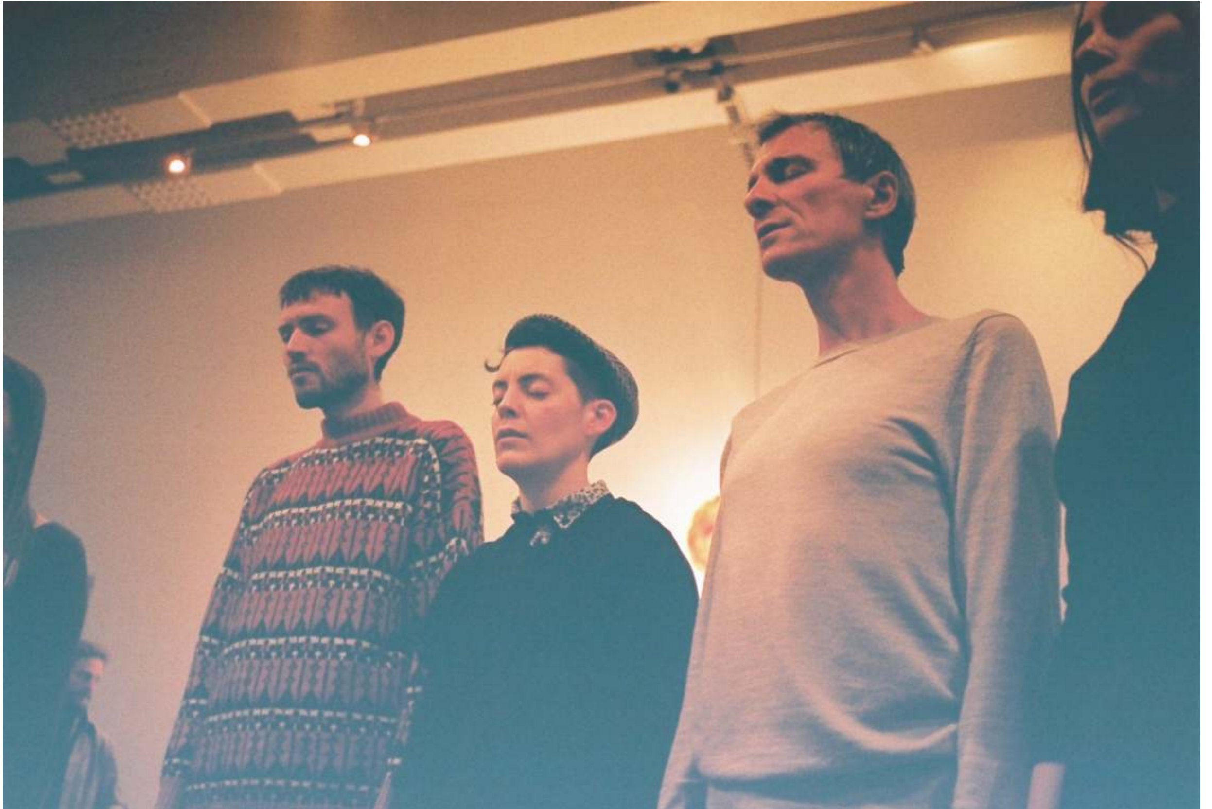
The Island Folk Choir perform 'Mola Mola', performance as part of Handed down and Handled, opening night, back to where we have not quite been, Arnolfini 2015