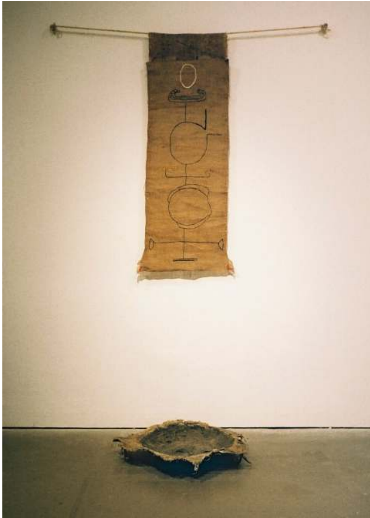
Land room installation view, back to where we have not quite been, Arnolfini 2015 Photography by Fourthland, 35mm.