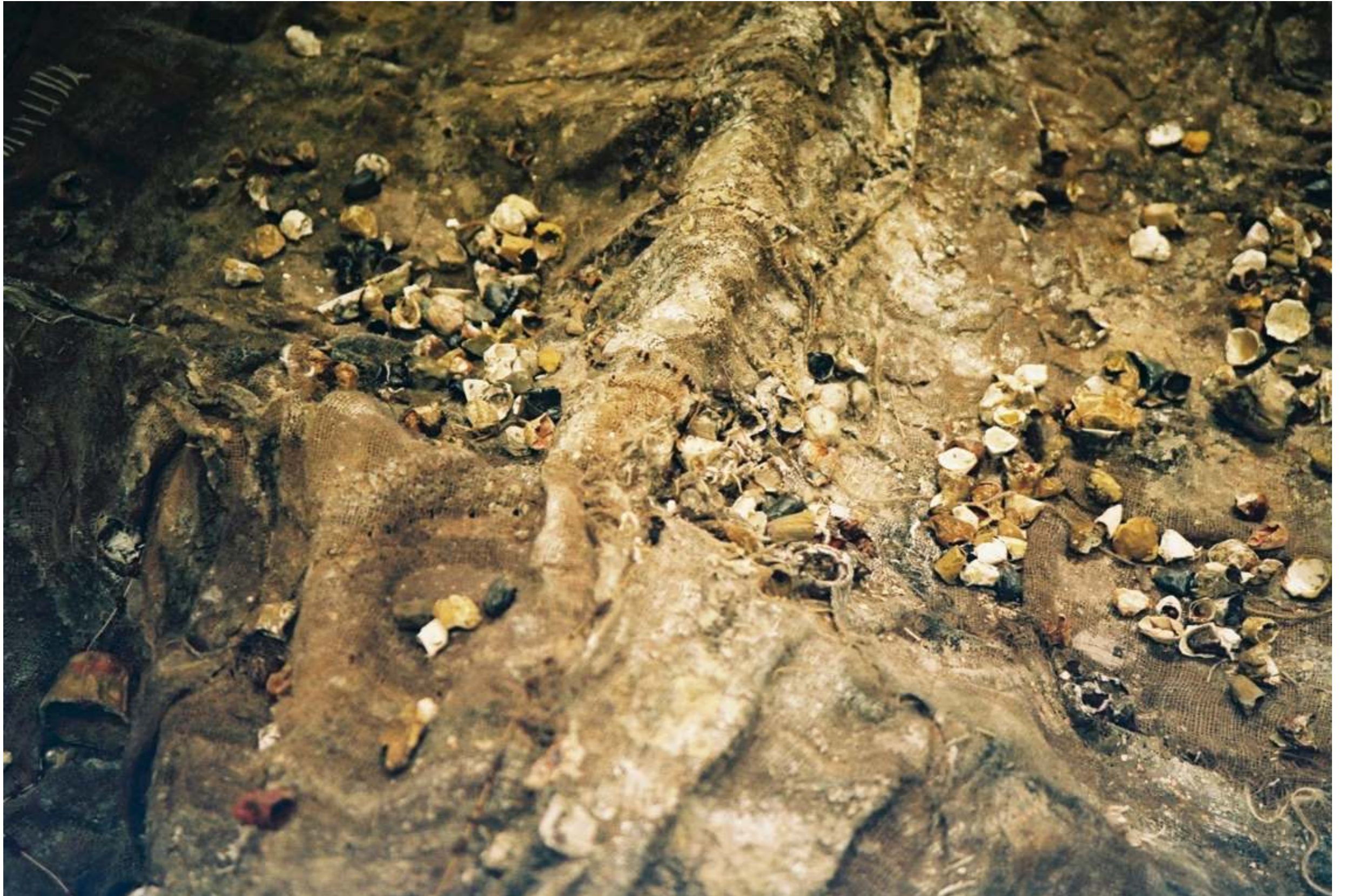
Mola Mola, Sea Room, back to where we have not quite been, Arnolfini 2015