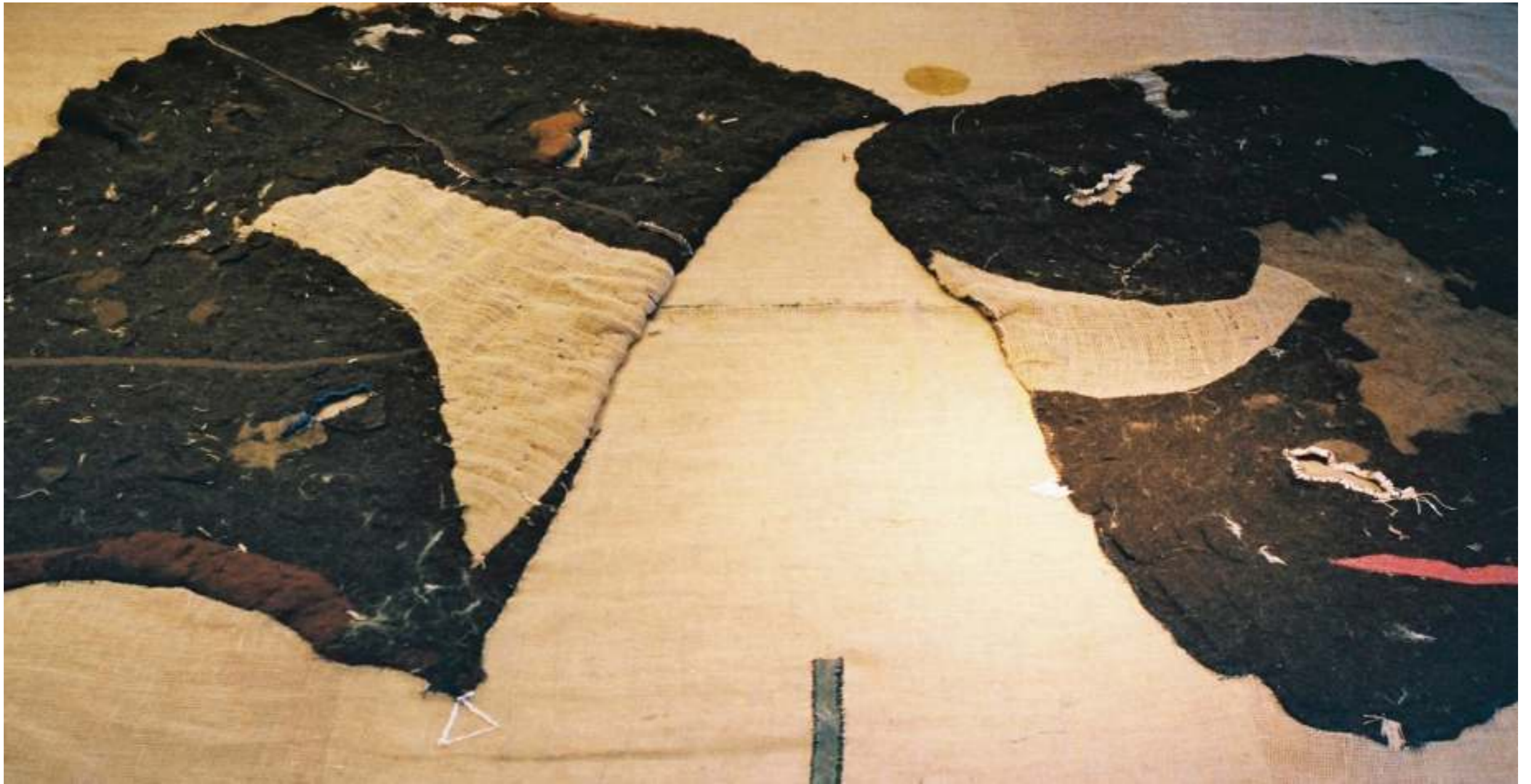
Ancient landscape surface, Third Space, back to where we have not quite been, Arnolfini 2015 materials: felted wool and natural fibres, hessian, linen, silk, wax and pigment