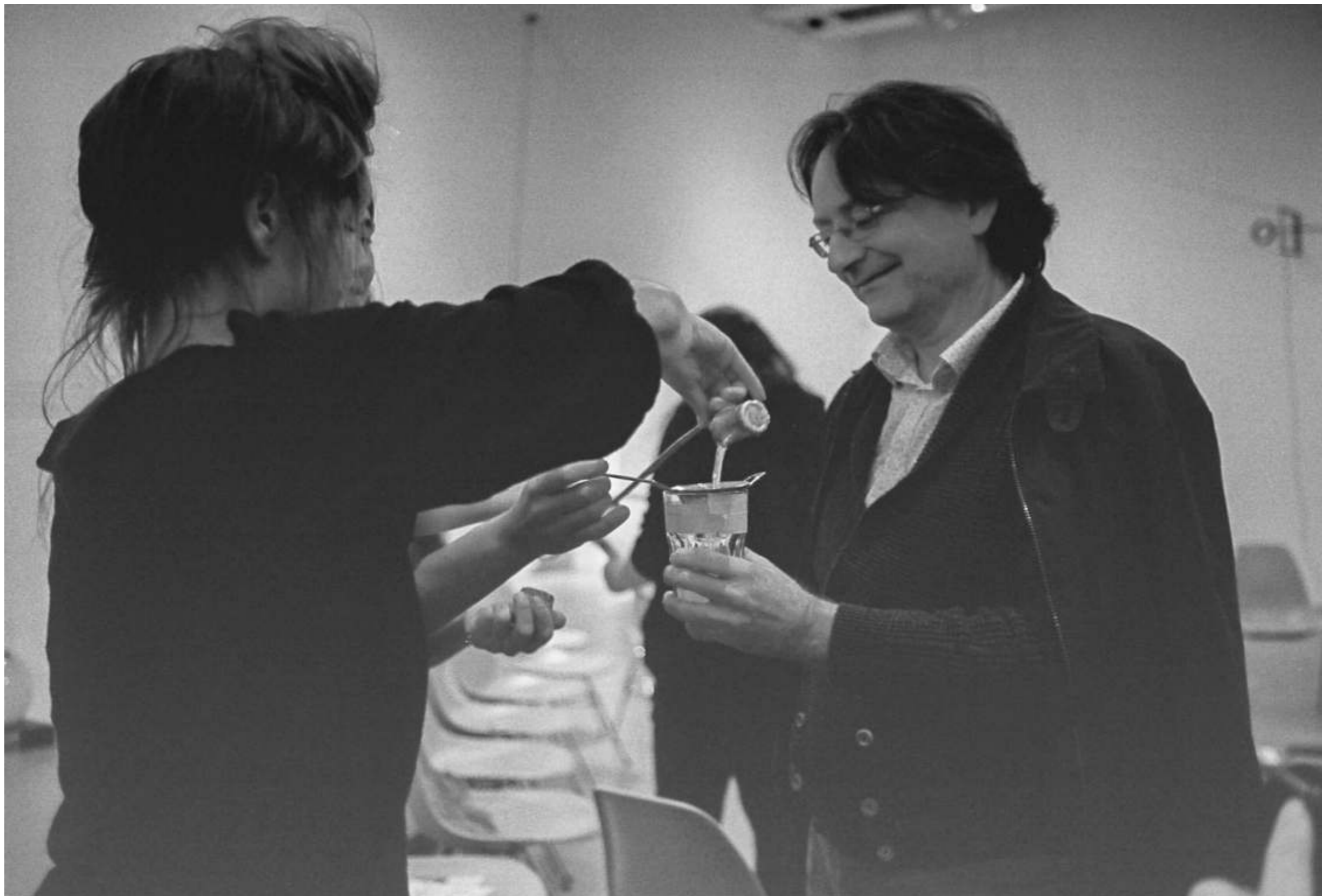
Serving 'the beginnings of culture', back to where we have not quite been, Arnolfini 2015