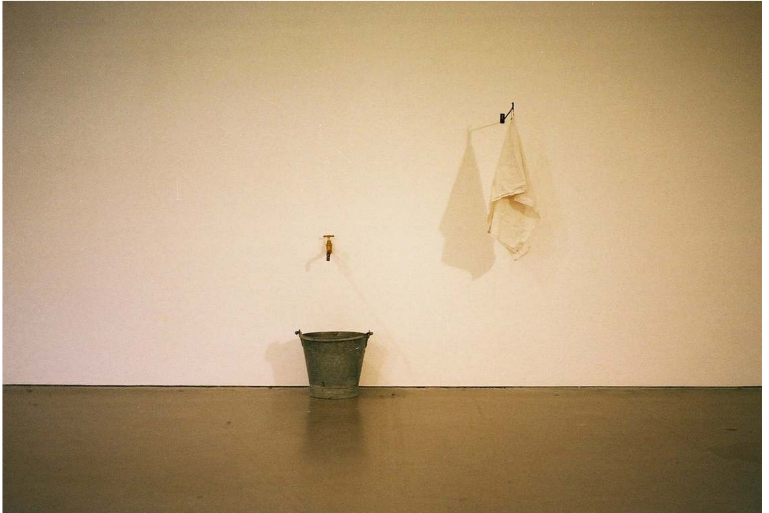
Sea Room installation view, back to where we have not quite been, Arnolfini 2015 materials: handling cloth, tap and bucket with water