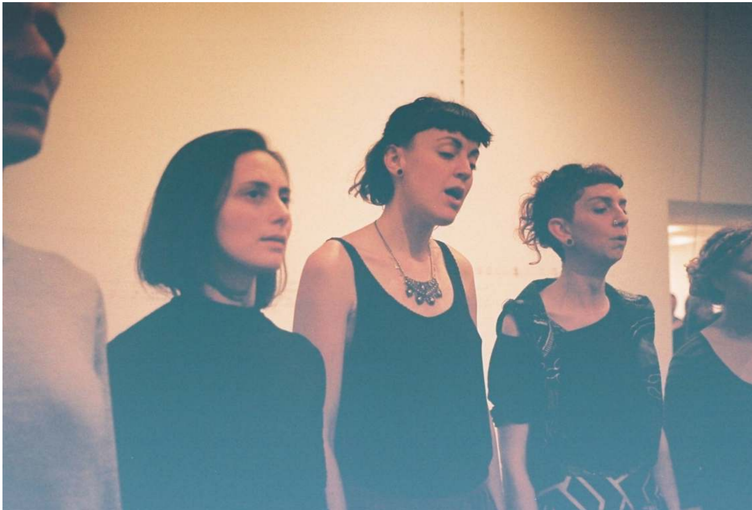
The Island Folk Choir perform 'Mola Mola', performance as part of Handed down and Handled, opening night, back to where we have not quite been, Arnolfini 2015 Photography by Fourthland, 35mm.