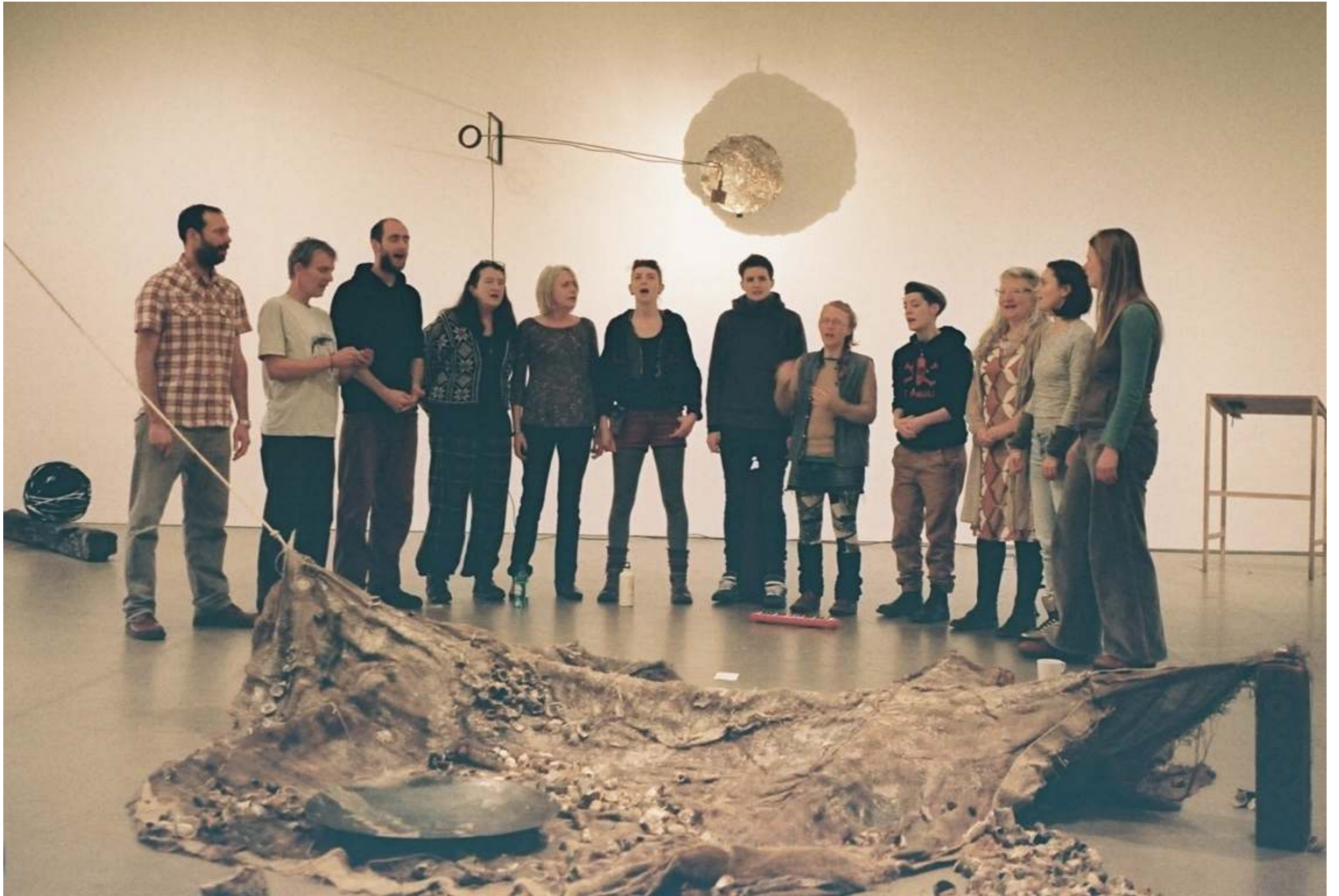
Constructed by many mouths, Sunday Song, The Island Folk Choir, back to where we have not quite been, Arnolfini 2015