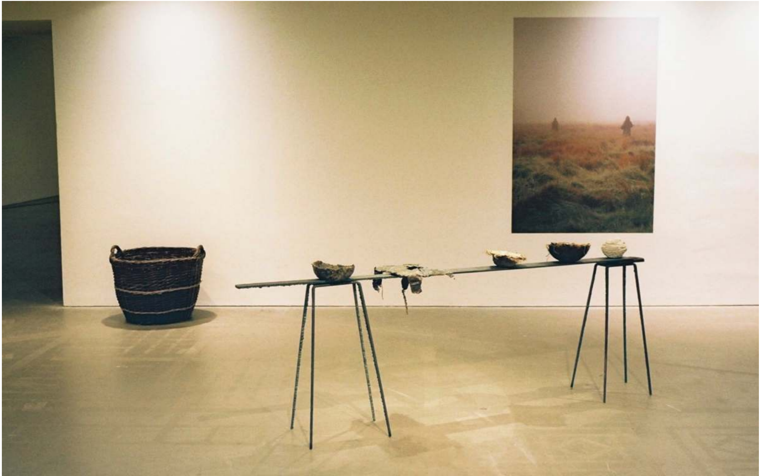
Land room installation view, back to where we have not quite been, Arnolfini 2015