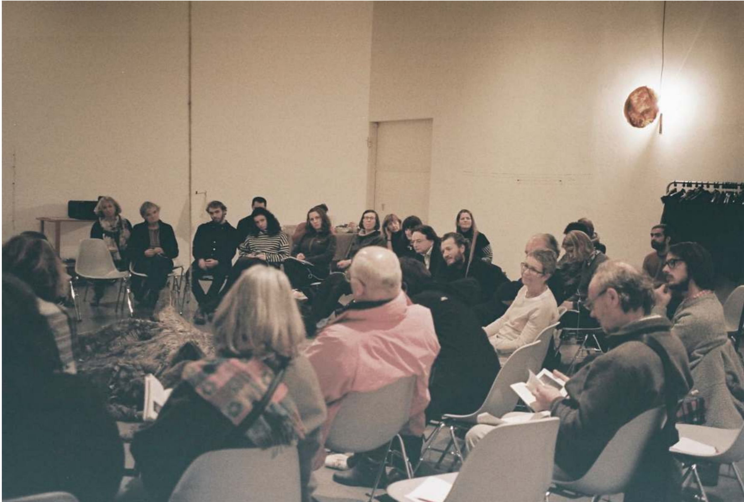
back to where we have not quite been conference, Arnolfini 2015