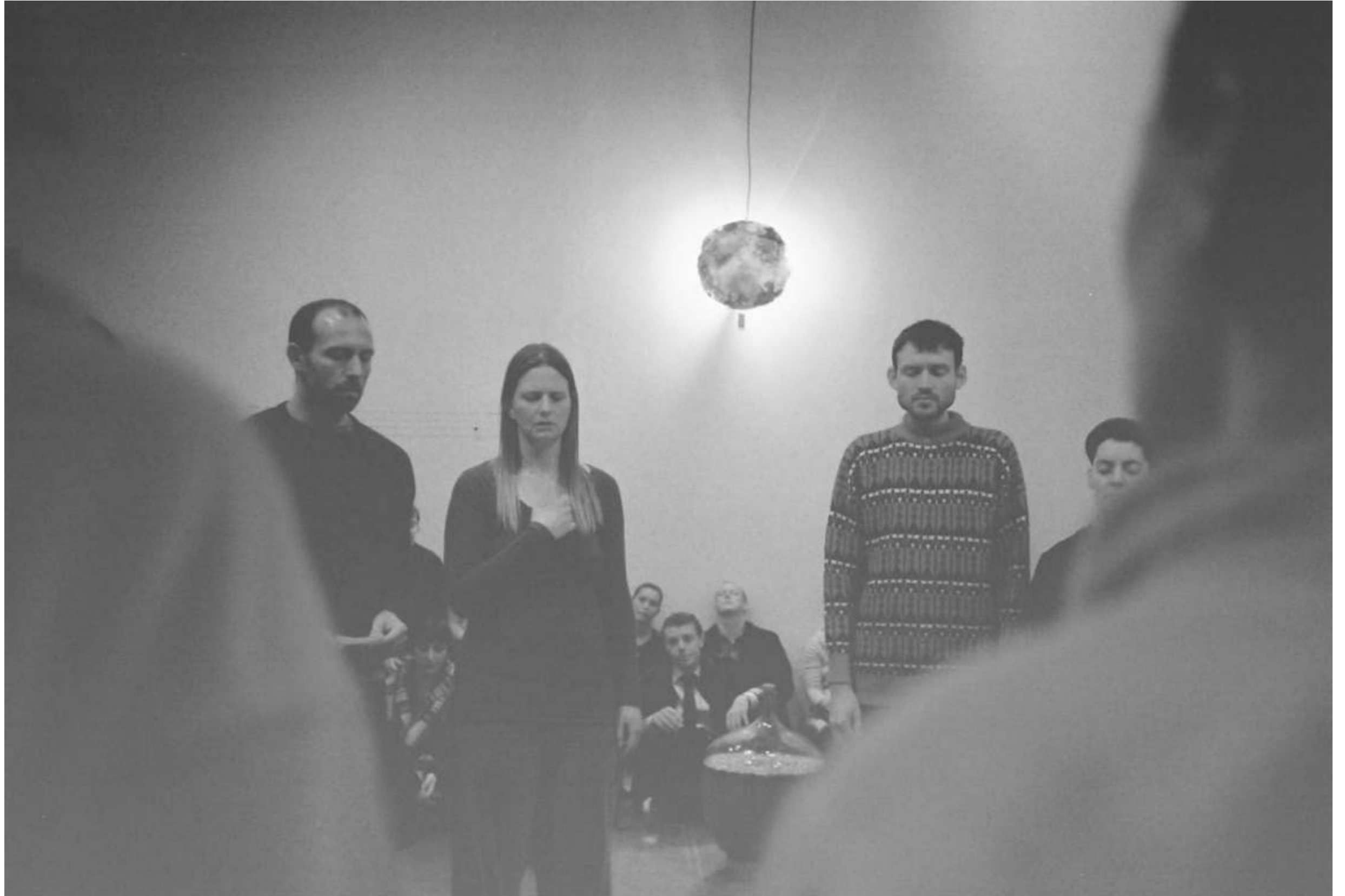
The Island Folk Choir perform 'Mola Mola', performance as part of Handed down and Handled, opening night, back to where we have not quite been, Arnolfini 2015