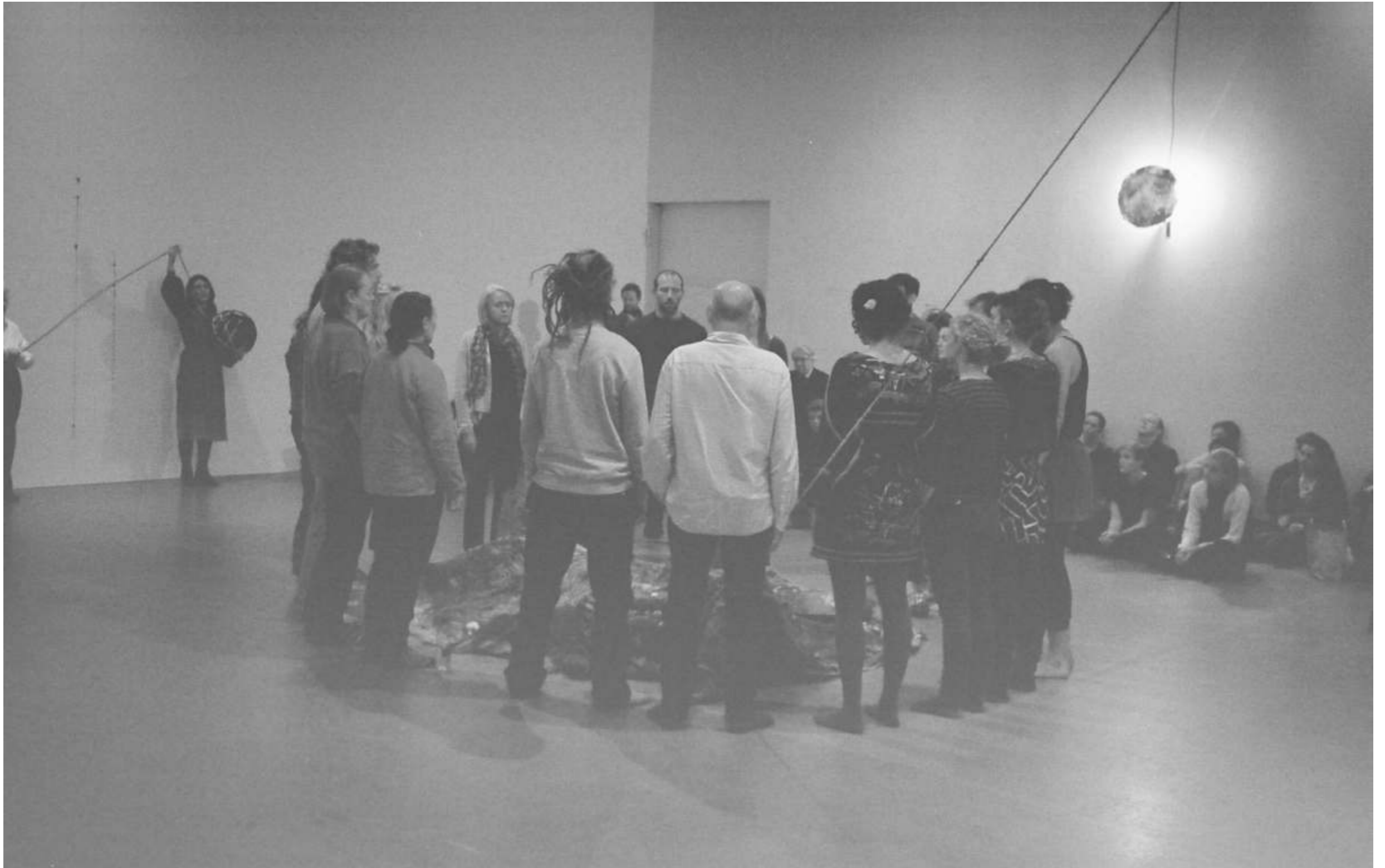
The Island Folk Choir perform 'Mola Mola', performance as part of Handed down and Handled, opening night, back to where we have not quite been, Arnolfini 2015