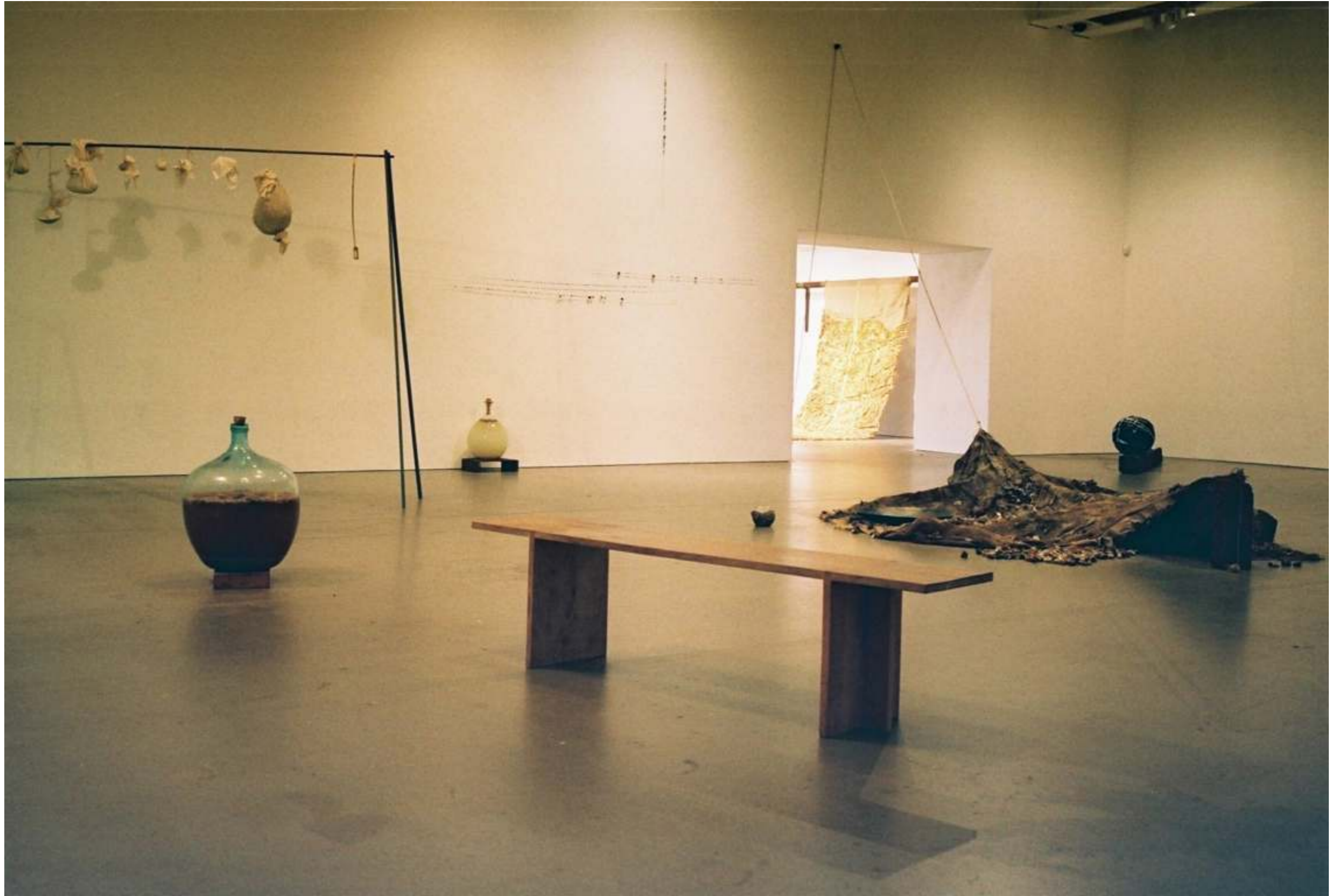
Sea Room installation view, back to where we have not quite been, Arnolfini 2015