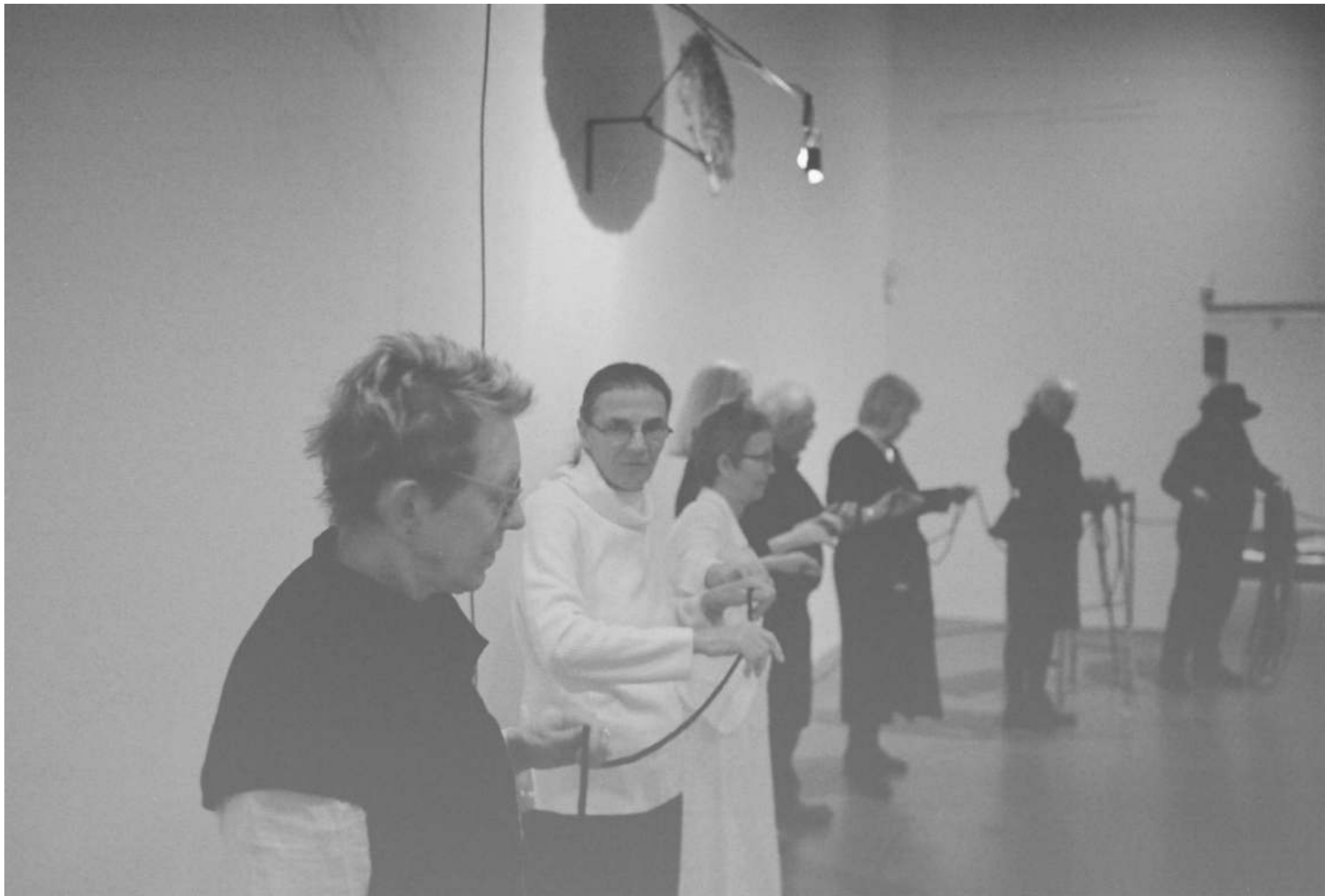
The Passing, performance as part of Handed down and Handled, opening night, back to where we have not quite been, Arnolfini 2015