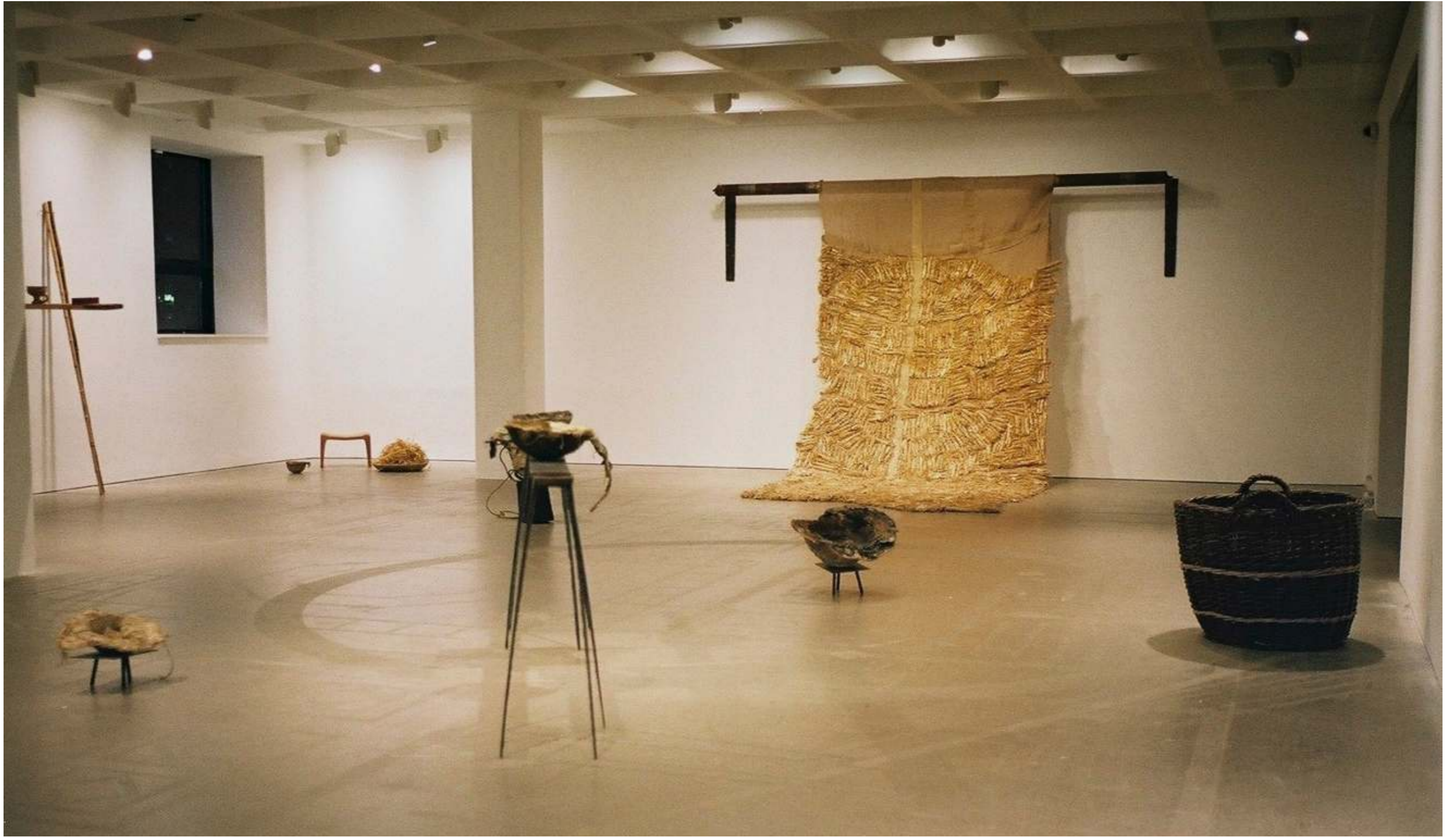
Land Room installation view, back to where we have not quite been, Arnolfini 2015