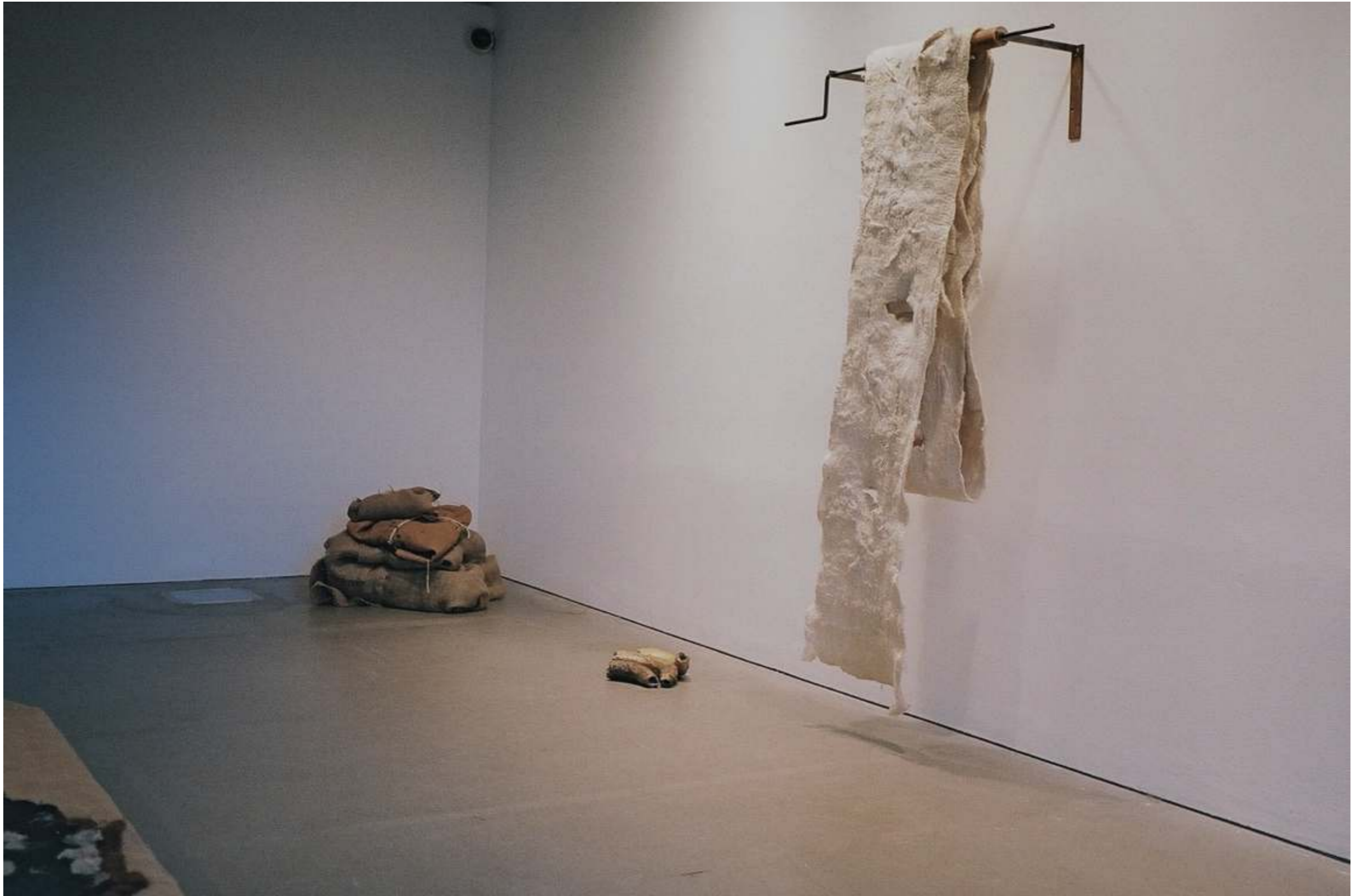
Third Space installation view, back to where we have not quite been, Arnolfini 2015