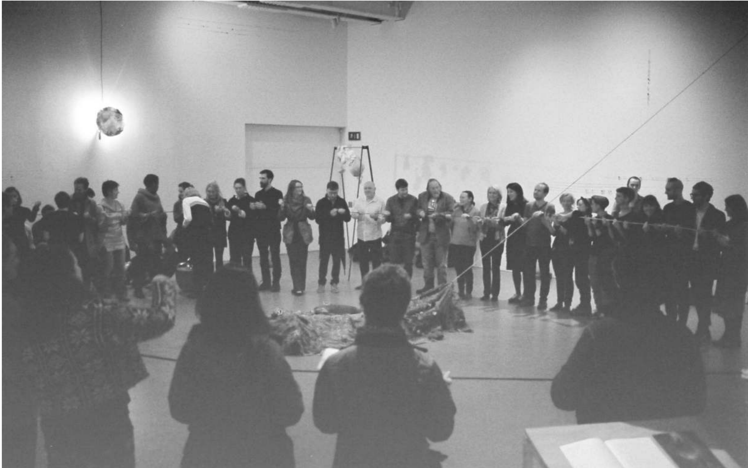
Handed down and Handled, performance, opening night, back to where we have not quite been, Arnolfini 2015