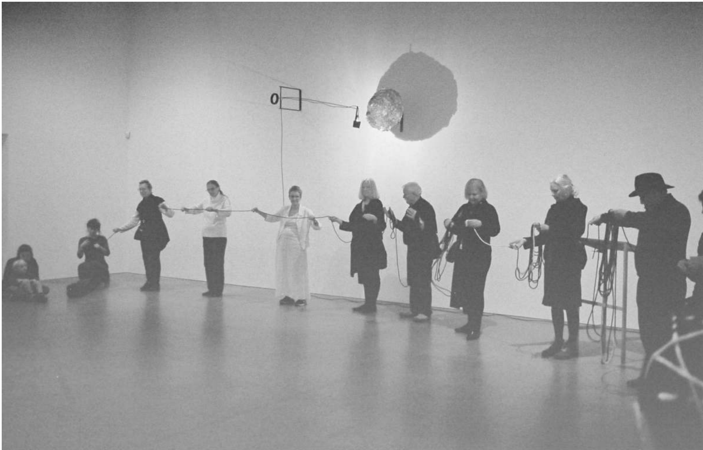
The Passing, performance as part of Handed down and Handled, opening night, back to where we have not quite been, Arnolfini 2015