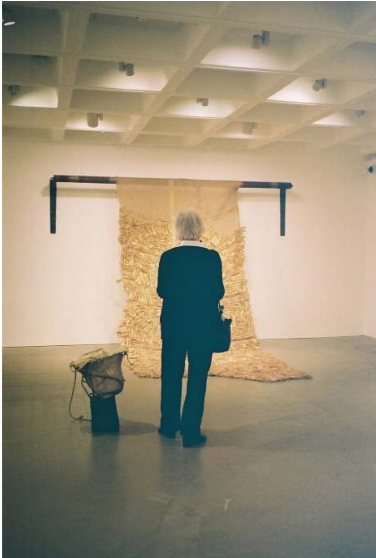
Visitor, back to where we have not quite been, Arnolfini 2015