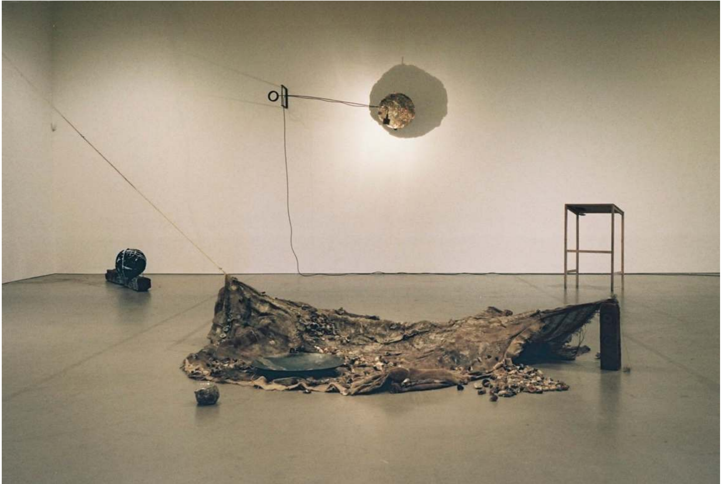
Sea Room installation view, back to where we have not quite been, Arnolfini 2015