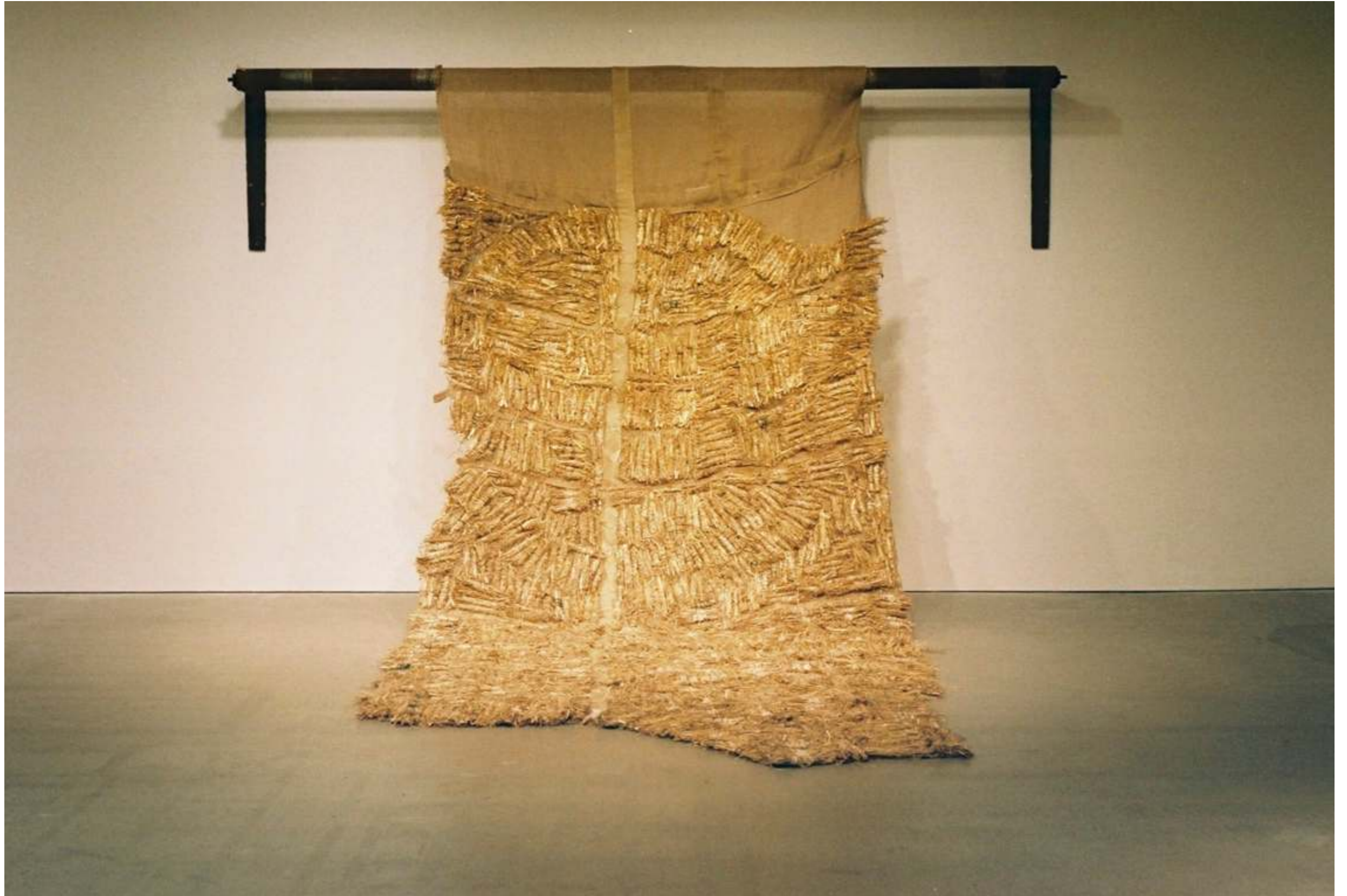
New Land, Land Room, back to where we have not quite been, Arnolfini 2015 materials: hessian, linen, straw, string, threads, wax