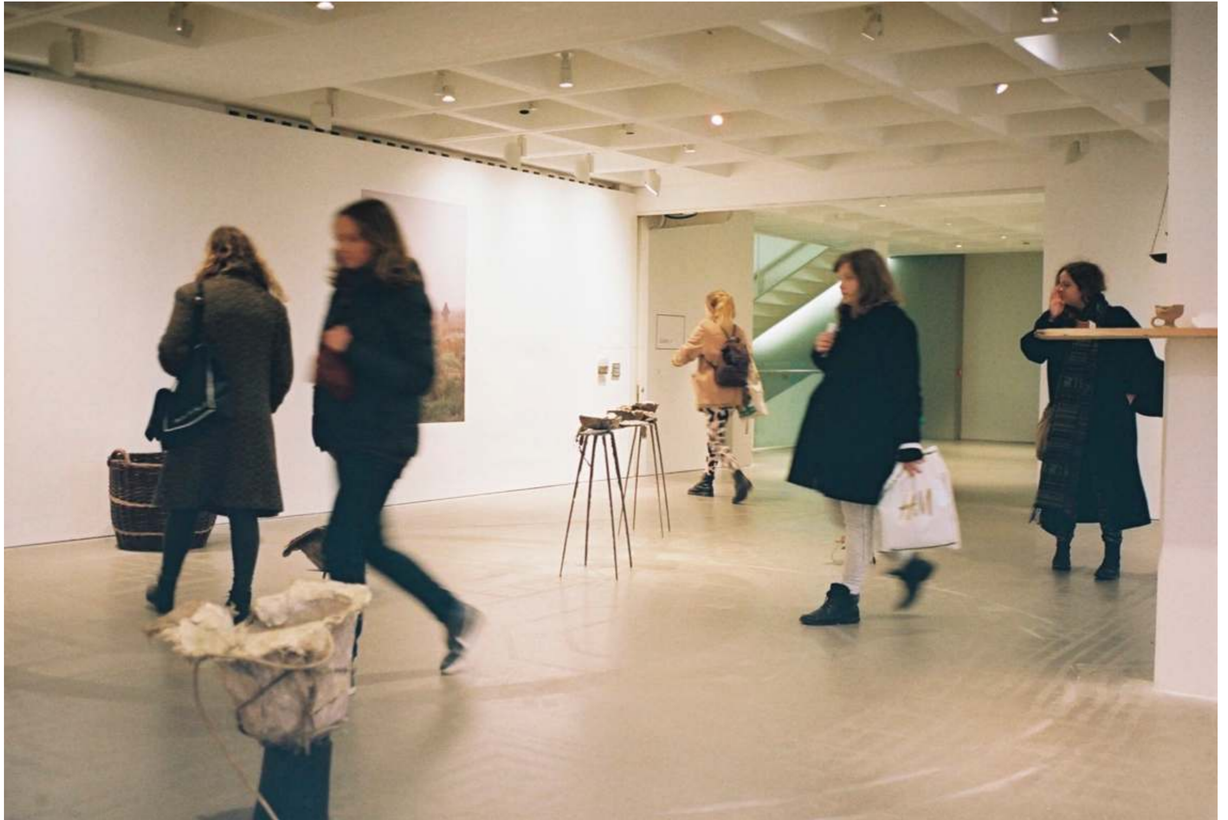
Visitors, back to where we have not quite been, Arnolfini 2015